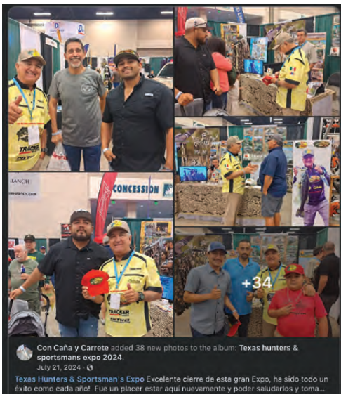
Con Caña y Carrete added 38 new photos to the album: Texas hunters & sportsmans expo 2024. July 21, 2024 · 📍 Texas Hunters & Sportsman's Expo Excelente cierre de esta gran Expo, ha sido todo un éxito como cada año! Fue un placer estar aquí nuevamente y poder saludarlos y toma...

Bert Ogden Auto Group 2024 Title Sponsor